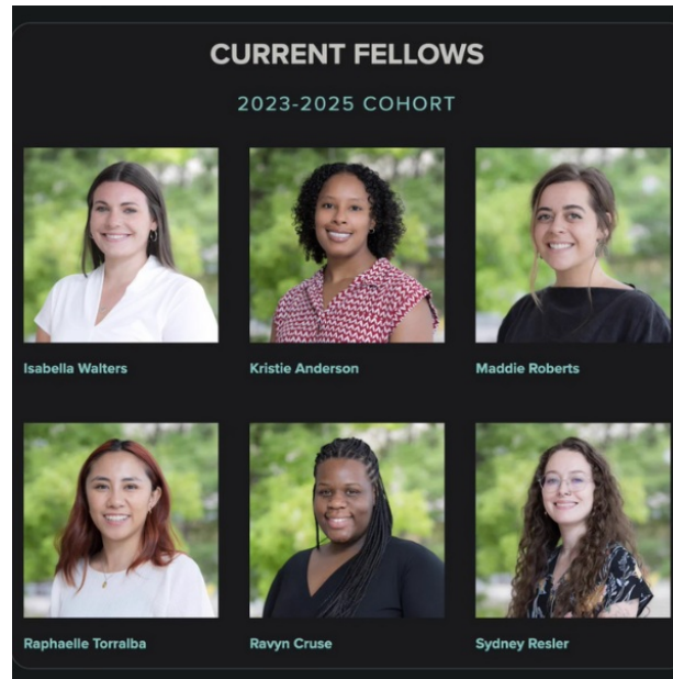
UWPHI's 2023 Population Health Fellowship Cohort

Wisconsin Public Health Association to pilot an initiative providing scholarships to incoming, early-career fellows to help support their transition and relocation to Wisconsin as part of public health workforce initiatives in Wisconsin. Click here to learn more and support the sustainability of this program.