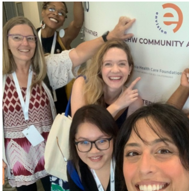
UWPHI's Envision Team at Unity Conference

Envision's online resources also expanded this year, with a new resource library . Explore toolkits, webinars, podcasts, and more created by Envision, national partners, and other organizations covering topics ranging from advocacy to health equity to sustainability.