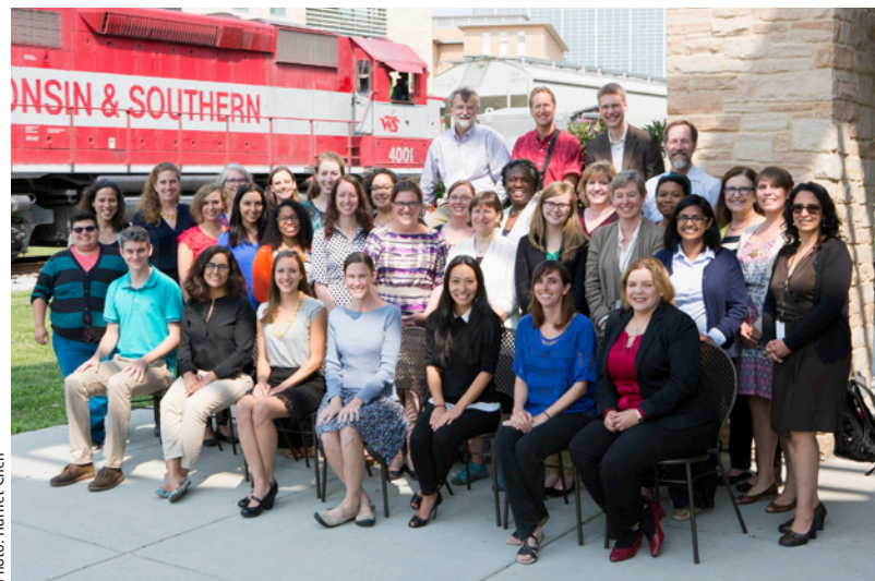
Population Health Fellows and Preceptors, 2015

Wisconsin Division of Public Health, Office of Minority Health and Centro Hispano