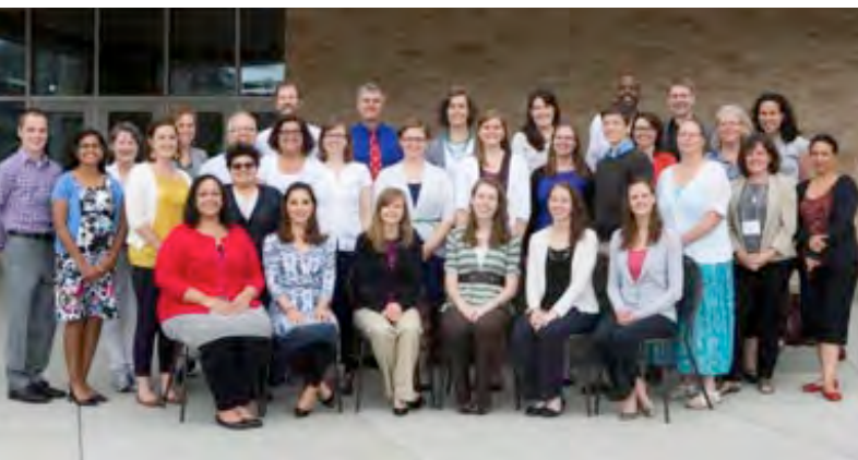
Population Health Fellows and Preceptors, 2014